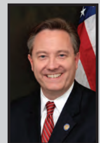
Senator Doug Stoner D-Smyrna