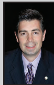
Senator Chip Rogers R-Woodstock