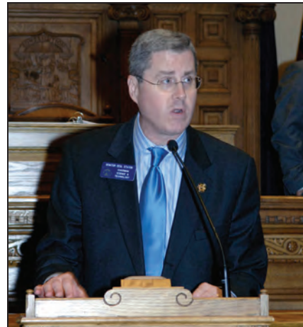
Senator Cecil Staton, one of the leaders of the fight for trauma care funding.

Allows the Commissioner of Insurance to adopt policies to promote, approve and encourage health savings account eligible high-deductible plans in Georgia. PASSED, SIGNED INTO LAW - Supported by the GCC