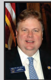
Senator Jeff Mullis R-Chickamauga