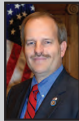
Senator Chip Pearson R-Dawsonville