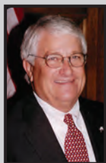
Senator John Bulloch R-Ochlocknee