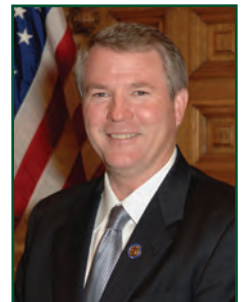
Senator Ross Tolleson