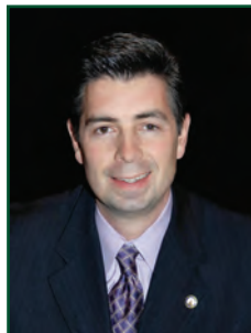
Senator Chip Rogers