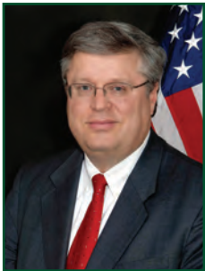
Senator Don Balfour