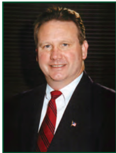
Senator Tim Golden