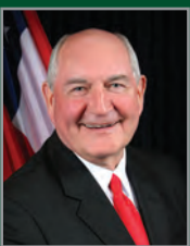
- Gov. Sonny Perdue

"As Georgia continues to grow and prosper, it is incumbent upon us to develop a comprehensive statewide plan that addresses our long-term water needs and conservation efforts. Water nourishes our environment and is a major driving force of our state's economy."