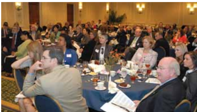
Power Lunches provide members an opportunity to meet leadership and fellow members.