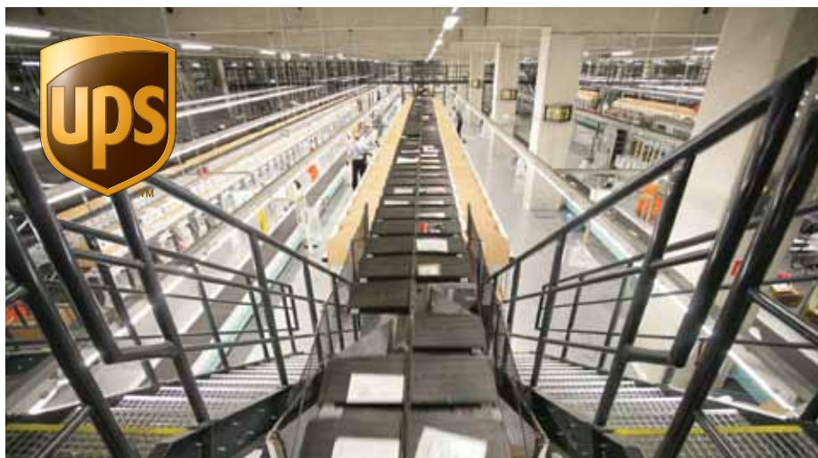
Packages being sorted at the UPS air hub in Colonge, Germany.